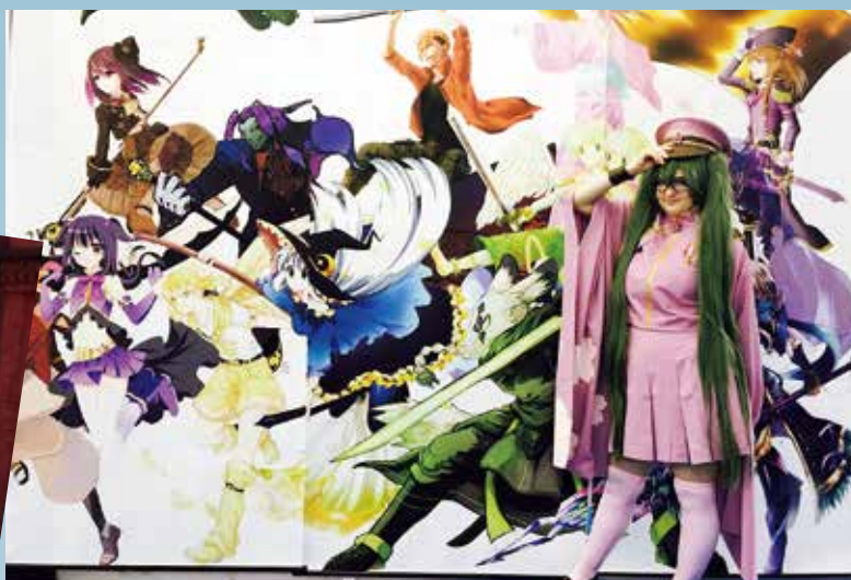
Learning about pop culture event management at the Toyoko Manga Anime Festa.