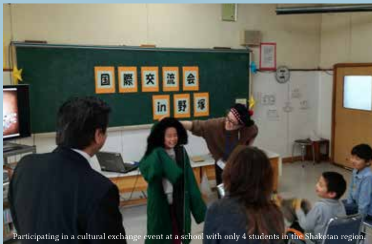
Participating in a cultural exchange event at a school with only 4 students in the Shakotan region.