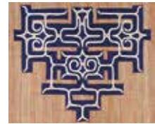
© Rumiko Fujitani, 2013. Traditional Ainu pattern for Attus clothing.

Today, Hokkaido has a population of 5.3 million people, but the region was only fully incorporated into Japan in the mid-nineteenth century. Hokkaido is the home of the indigenous Ainu people. As a place where various cultures meet, Hokkaido is an ideal location to consider issues of cultural diversity and multiculturalism in Japan, Asia and beyond.