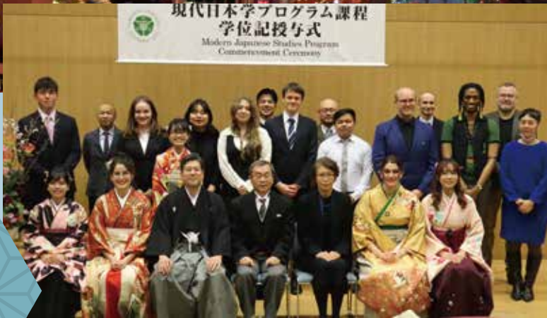
Graduation Picture of Class of 2020