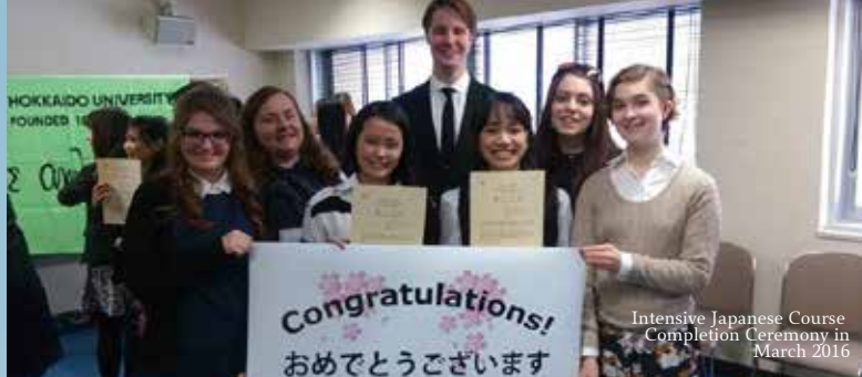
Intensive Japanese Course Completion Ceremony in March 2016