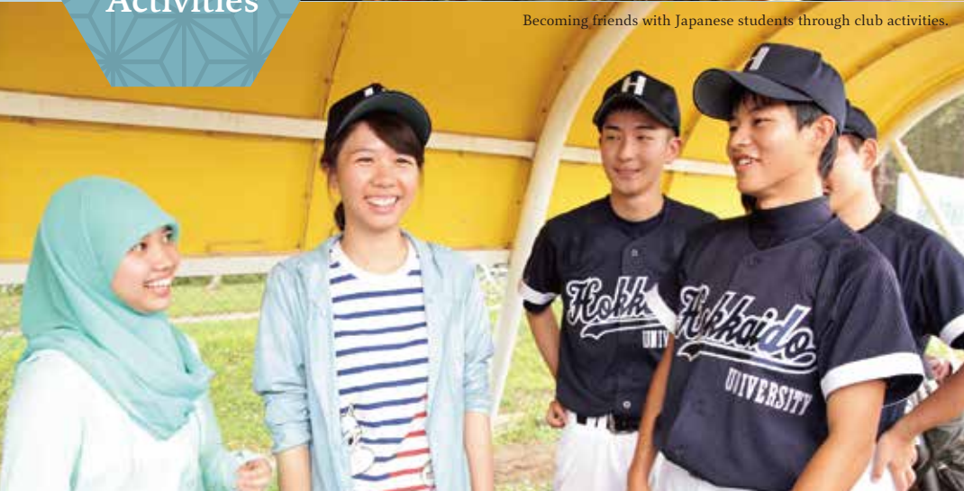
Becoming friends with Japanese students through club activities.

Our staff will help you adapt to life in Japanese society. Things may not always go smoothly, but the International Student Support Desk and university's bilingual counseling service is always there to help you.