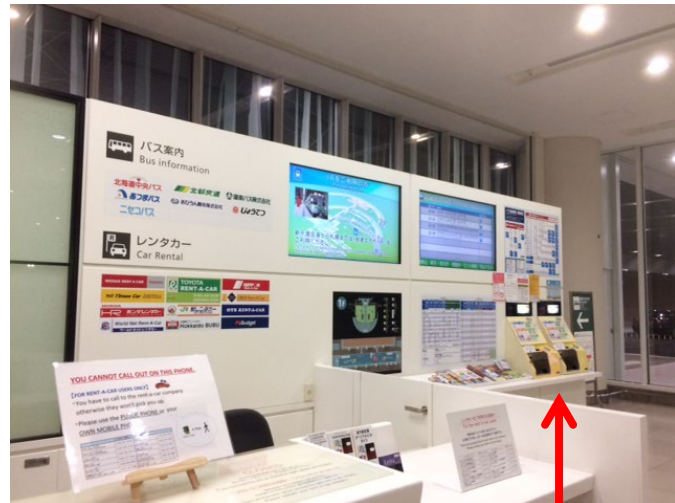
Bus Information and Ticket Desk

After confirming the time and buying the ticket, find the bus stop No.65.