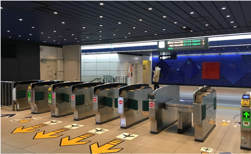
Insert your ticket